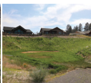
Impressive vegetative growth by July 2021