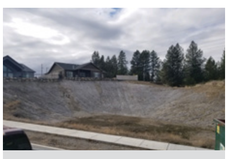
Basin prior to application

When taking on any new project, there's always that drive to follow through with the right solution. But when a project is under extreme scrutiny, the expectation to deliver can be even greater. Lake Creek Development, LLC, had a steep, sandy retention basin in the Twisted Willows Development in Spokane, Washington, that needed to be revegetated. After two failed attempts with other products, once with a competitor's hydromulch in early 2020 and once with the mulch and jute netting later that year, Lake Creek Development and HydroLawn consulted with Profile® Products High Efficiency (HE) mulch professionals to develop a solution that wouldn't disappoint.